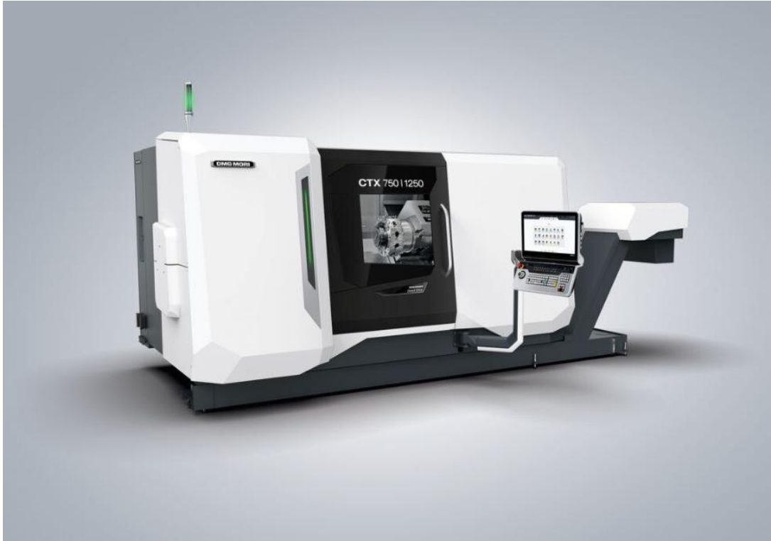
The CTX 750|1250 offers sufficient space for \varnothing 700 x 1,290 mm workpieces on an area of just 11.7 m 2 .

eva.manzenreiter@dmgmori.com dmgmori.com